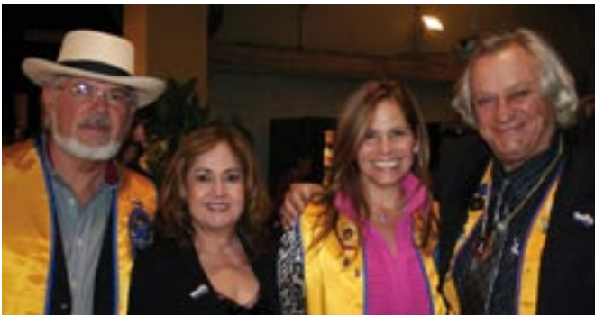
Lions gather at the Retter Patio for fellowship and a paella dinner.