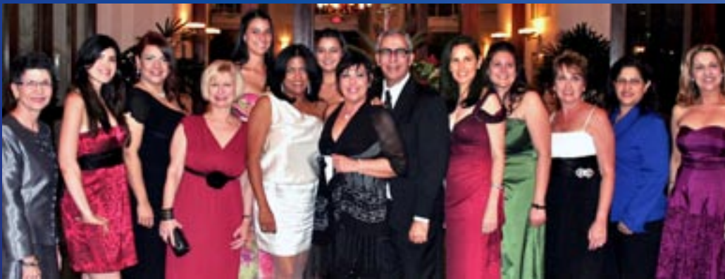
Eye Bank Staff celebrates 50 years