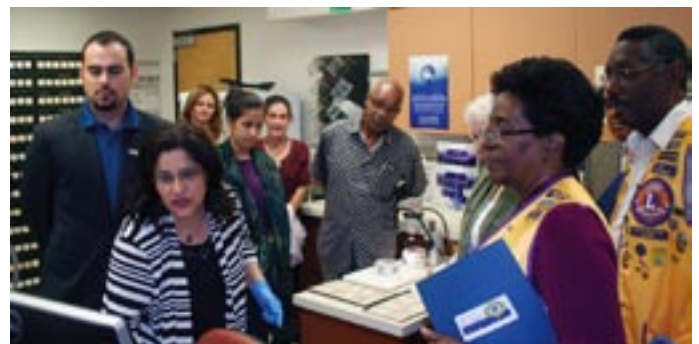
Lions and guests enjoy a tour of the eye bank pathology lab.