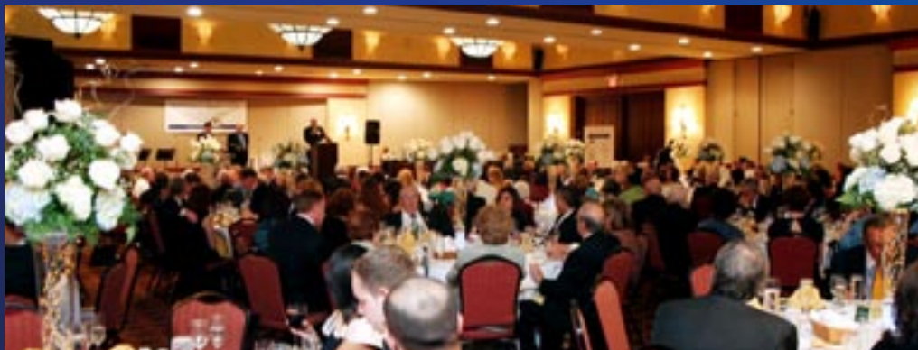
Stunning ballroom welcomed dinner guests.