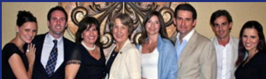
Representatives from The Lubitz Financial Group, a sponsor of the Installation Dinner.