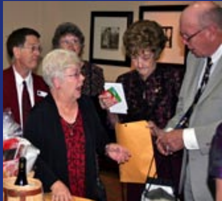
Attendees peruse and bid on silent auction items.