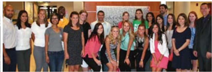
A large group of students from Nova Southeastern University attended.