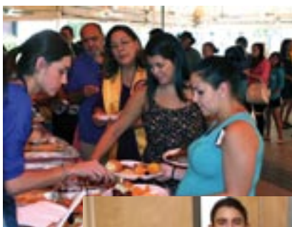
At left, guests line up for the barbecue and, below, are children of Eye Bank staff who helped serve at the lunch.