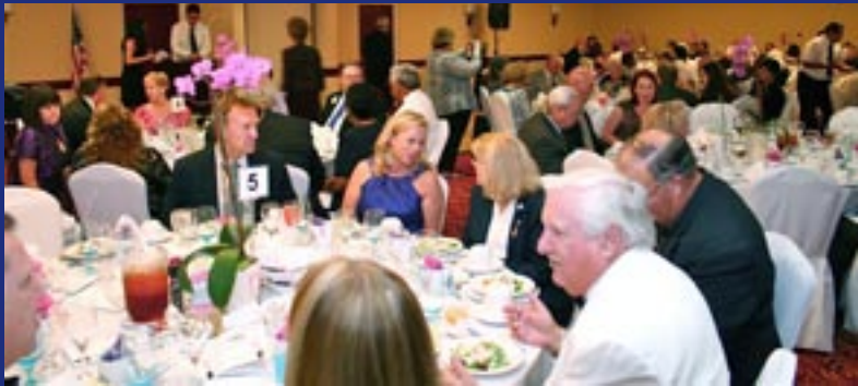
Lions and guests enjoy dinner before the Installation of Officers.