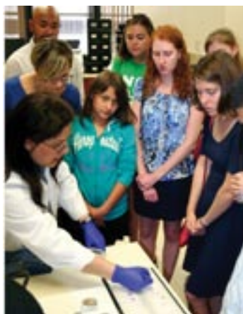
After lunch, tours were offered of the eye bank and pathology lab.