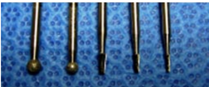
Tools used to contour and drill with the micro-mill

The micro-mill instrument was recently demonstrated at the Eighth KPro Study Group Meeting and immediately drew enthusiastic interest from doctors